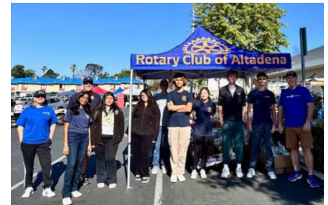
Above: Volunteers at Clean-up Day Loma Alta Park